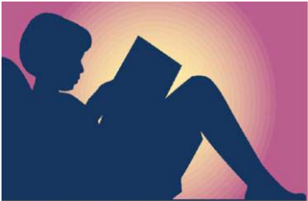
JULY SCRIPTURE READINGS

July 15 Choose Spiritual Living Deuteronomy: 8-15, 19 Choose Life Psalms 25:1-9 Prayers for guidance Colossians 1:1-14 We're praying for you Luke 10:25-37 The Good Samaritan